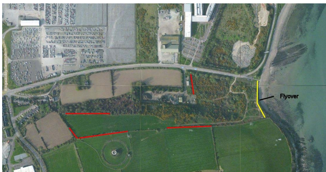
Figure 2 showing general bat activity patterns. Red indicates Common Pipistrelle, Yellow indicates Soprano Pipistrelle.