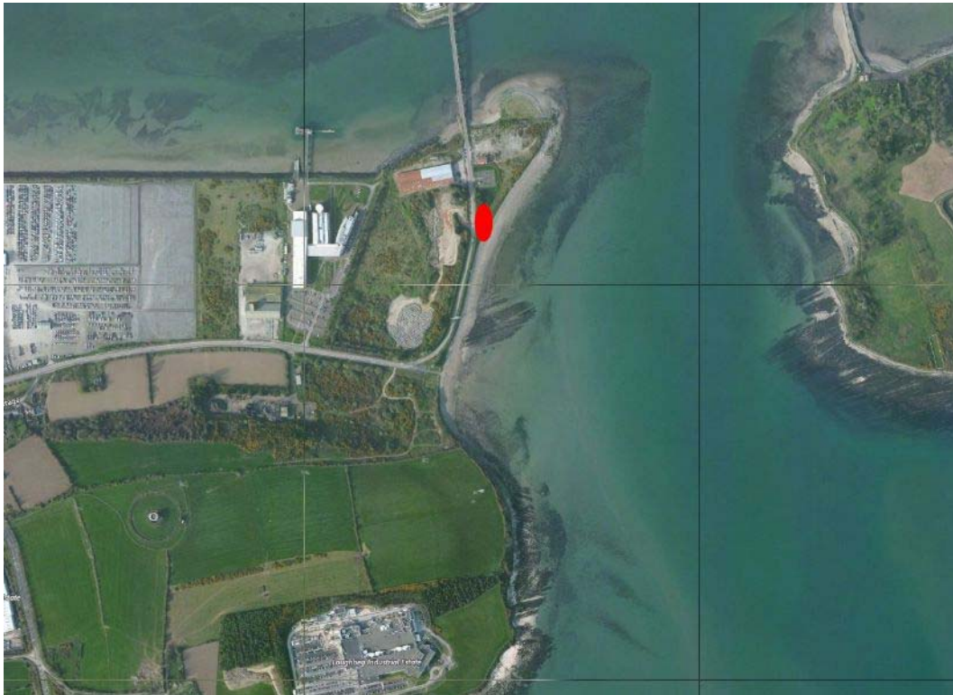
Figure 1 showing closest signs of otter activity (sprainting site).

Surveys by DixonBrosnan in 2014 and 2015 did not record the presence of otter within a radius of 150m from the study area, although some sprainting activity was recorded 300m north of the site (See Figure 1 ). It is noted that the upper shore of the beach, which adjoins the site, is extensively used by the general public, and that usage is highest in proximity to the car park that is located immediately adjacent to the proposed development site. These circumstances, particularly where dogs are also present, may reduce usage of the area by otter. Whilst otters may use the shore areas in proximity to the site on occasions, no holts were noted in this area, nor are they likely to occur in the area affected by beach nourishment works in the future.